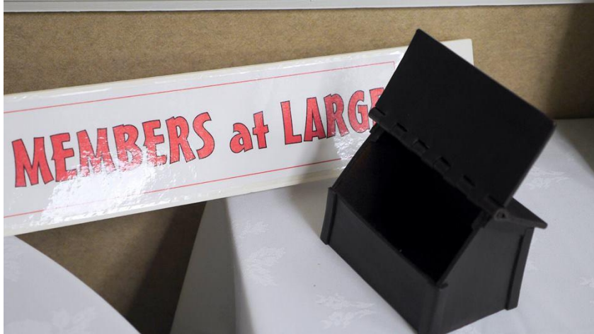
Members at Large's Table