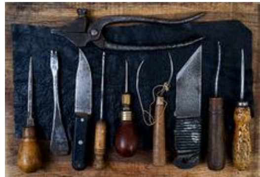
Some handy tools