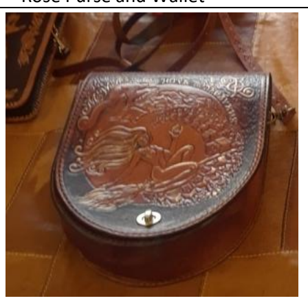
Greg Belenky – Round Bottom Purse