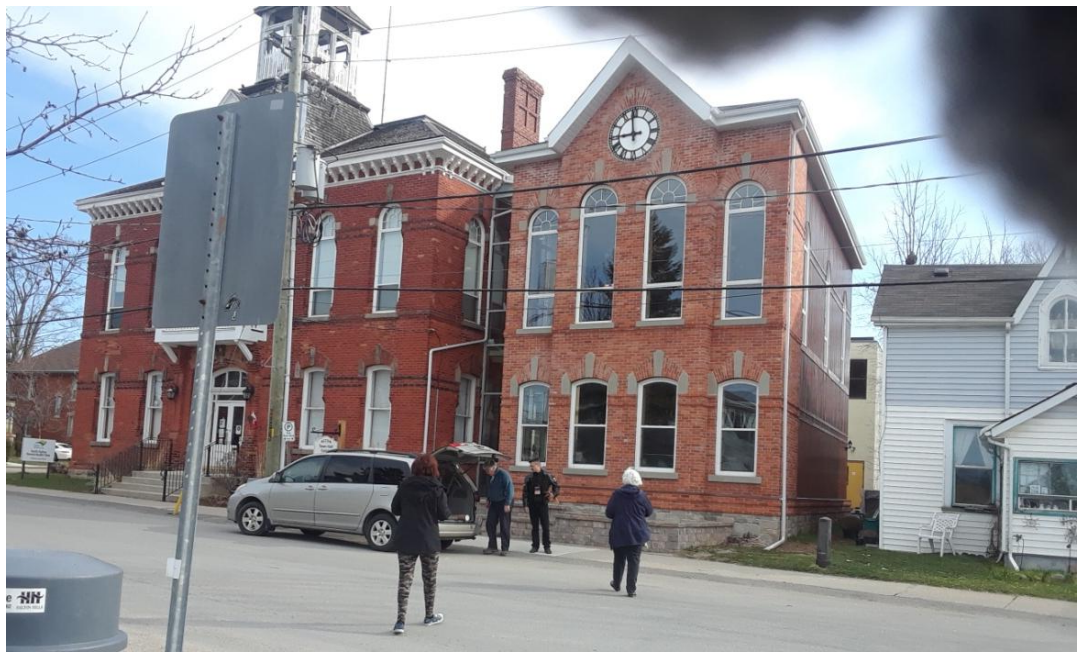
Welcome to Acton Town Hall