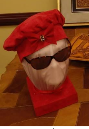
Best Wearable Item - Kim Winchester – Red Hat