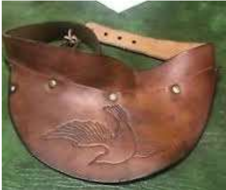
A summer eye shade made out of leather.

Page 2 Notes from the Editor, Highlights of the past Executive Mtgs, Membership Info, CSCL Larmour Library