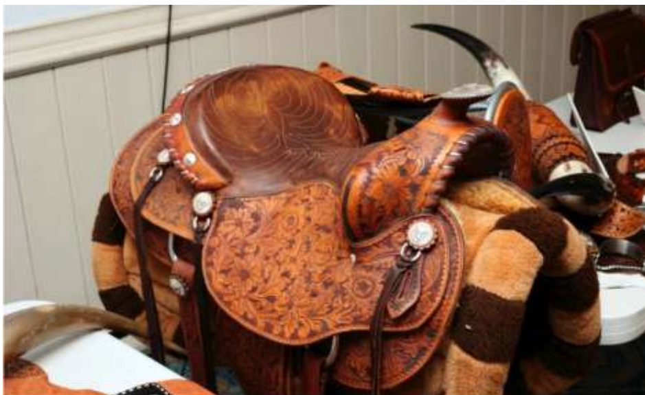
Fully Rigged Saddle

Leather Chaps, Spurs & Straps, Belts, Purses & Clutch Wallets, Stool Seat all decorated mostly in Western Floral Carving and Stamping.